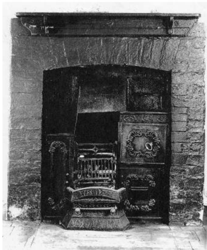
Range in one of the Tickhill Maison Dieu almshouses Courtesy © Crown Copyright. NMR Ref BB68/2068