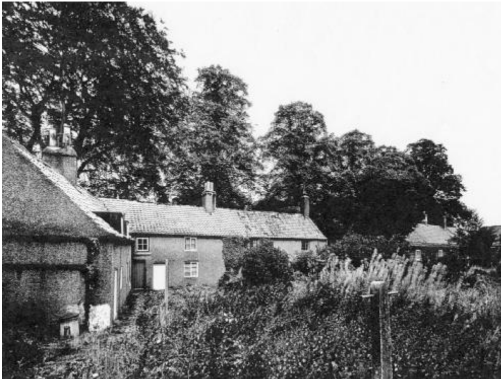
Lord Scarbrough's almshouses NMR Ref BB68/2060