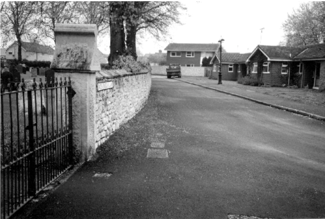
Modern view of Bride Church Lane