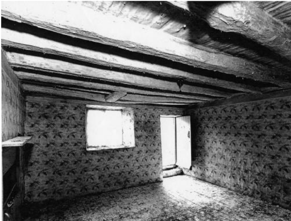
Interior of the same room showing the step down at the entrance Courtesy © Crown Copyright. NMR Ref BB68/2069