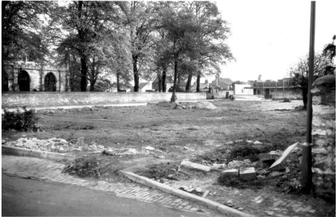
View after Tickhill Maison Dieu and Lord Scarbrough's almshouses were demolished at the end of 1967