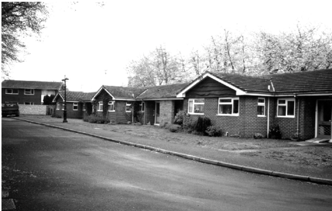
Bungalows built for pensioners in 1973 on the site of the almshouse gardens