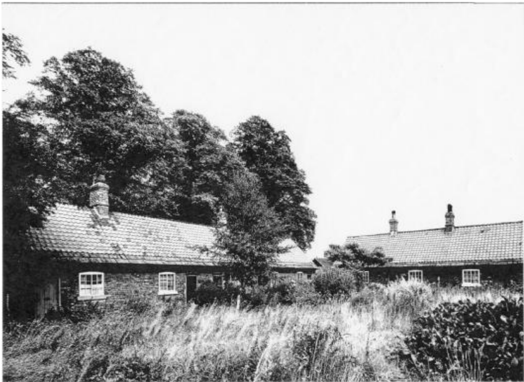
Tickhill Maison Dieu almshouses in 1967