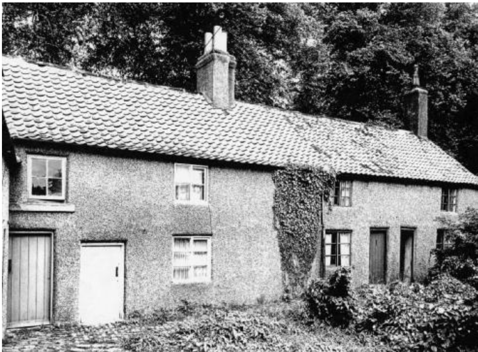
Lord Scarbrough's almshouses Courtesy © Crown Copyright. NMR Ref BB68/2062