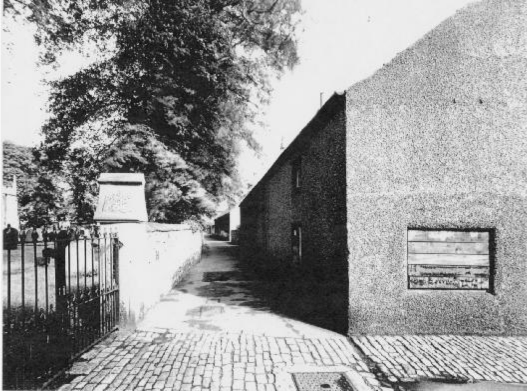
Rear of the almshouses next to the then narrow Bride Church Lane Courtesy © Crown Copyright. NMR Ref BB68/2067