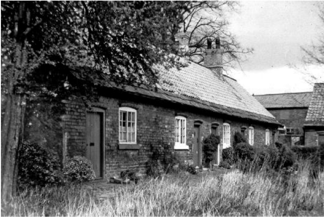
Row of five Tickhill Maison Dieu almshouses