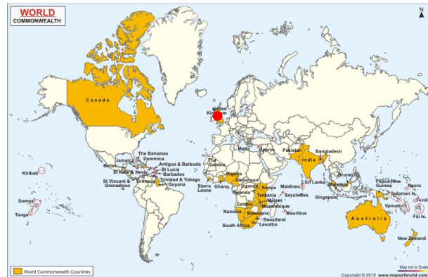
Her Majesty Queen Elizabeth II Acceded to the throne 6 th February 1952

Pop: (2013) 63,136,000 Capital: London Area: 243,305 sq km