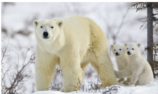
A polar bear and her cubs in northern Manitoba

Canada's size gives rise to a range of climatic types which, together with its varied topography, yields a huge biodiversity. Polar bears, musk ox, and caribou are found in the north (along with trillions of mosquitoes and black fly in summer!) while moose, beavers and black, brown and grizzly bears are found further south.